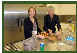
The hospitality team prepares Sunday refreshments.