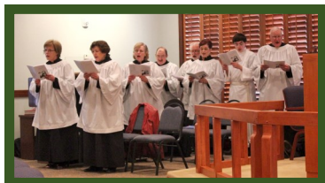
Our choir serves by making a joyful noise unto the Lord.