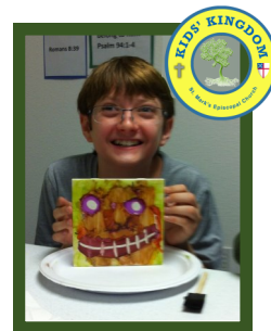
Christian Formation teachers help children learn the Bible while having fun!

As you begin to decide how to serve in a ministry, say this prayer of guidance from The Book of Common Prayer , page 832.